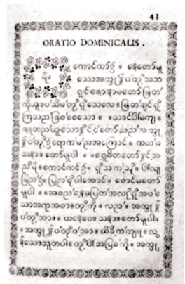
Barman 1776 from the Vatican Press's Oratio Dominica, in Barman: a language of the Kingdom of Ava and Island of Ceylon

With these few notes he covers a rich spectrum of history and the development of printing type from the culmination of Renaissance craftsmanship in the exotics of Robert Granjon to what Updike termed "Didotschen rubbish" and the beginning of Victorian excess. The "Propaganda Fide" specimen is a collation of sixteen pamphlets of exotic type