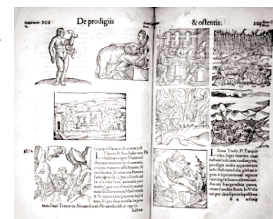
Prodigiorum 16th century forerunner of the Weekly World News

OF COURSE, THE COLLECTION HOUSES the work of San Francisco Bay Area printers, but among the surprises is a near-complete collection of the Eragny Press. The unusual productions of Pissaro's private press were Grabhorn's favorites am-