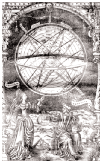
Oronce Finei: The author of Cosmographia (1532) is depicted with Urania the muse in this self-portrait wood engraving, printed by De Colines, Paris

lected editions of orthographic reformer Gian Giorgio Trissino, including that with the first use of Arrighi's chancery type of 1524 (Trissino used Arrighi's Greek characters to distinguish between various Italian pronunciations of o, e and z;